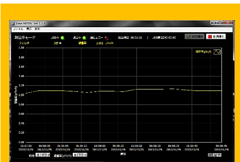
Dose rate measurement screen