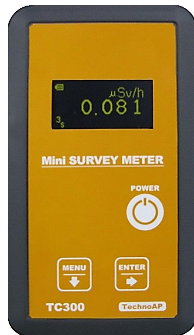
Dose rate mode