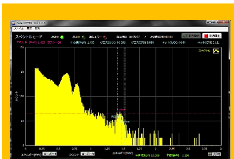
Spectrum measurement screen

NOTE: Application software is attached to this device