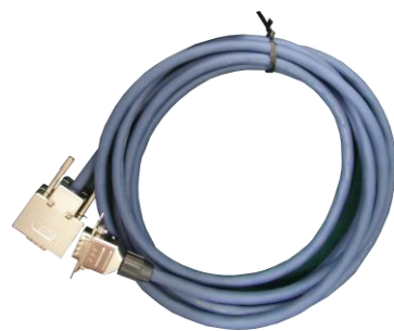
CBL-DSUB9-DSUB9-3 Cable sold separately