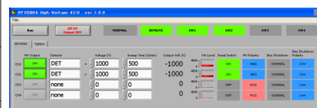
Screen of application software